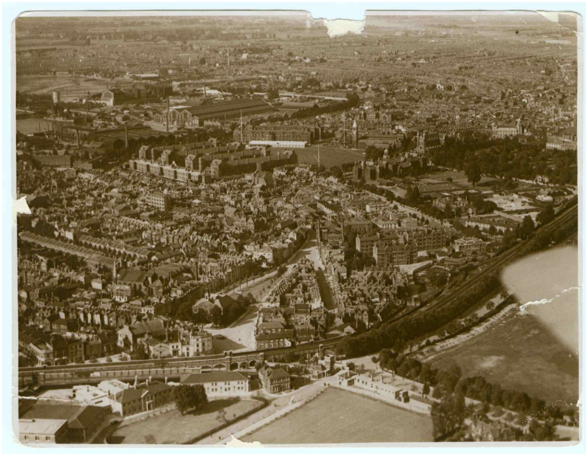
Aerial view of St. George's Square and the town of Portsea from the south-west, 1924