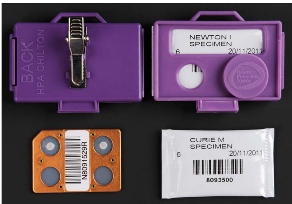
Components of the TLD

Dosimeters are re-usable: on completion of the read process, the stored signal is 'cleared' and the TLD can be issued again.