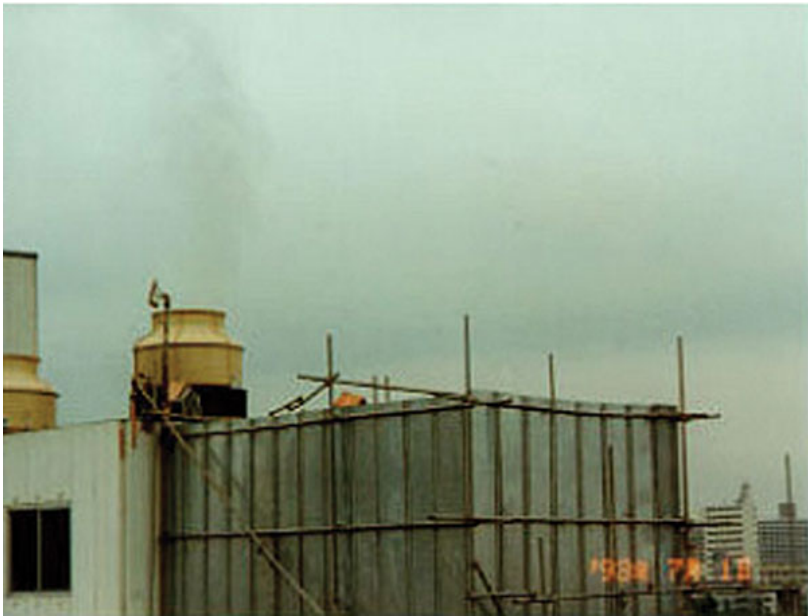
Takahashi et al , EID, 2003