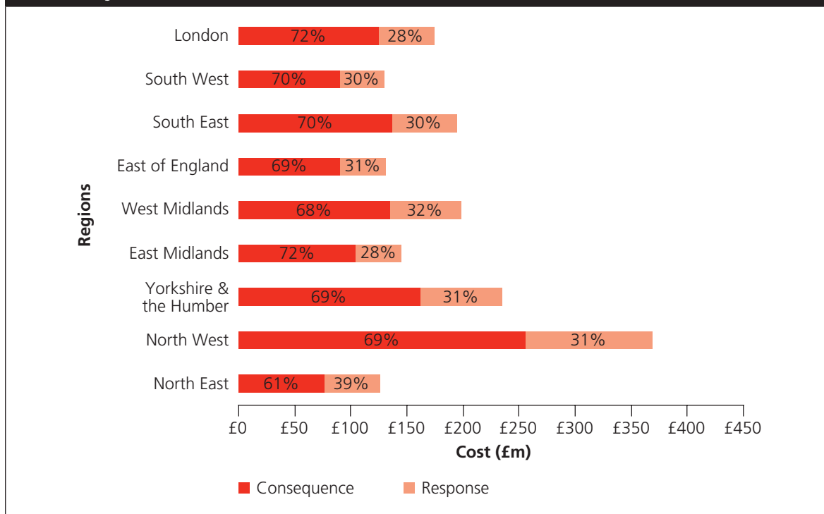
Figure 2: Estimates for the cost of arson by region (consequence and response costs only)