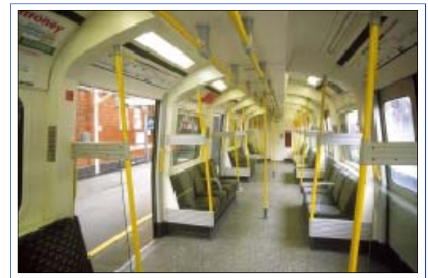
Photograph : Example of Interior

✗ Cross Denotes Approximate Position of Explosion.