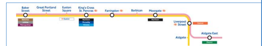
Circle Line Train

© Transport for London. London maps reproduced by Metropolitan Police by kind permission of Transport for London