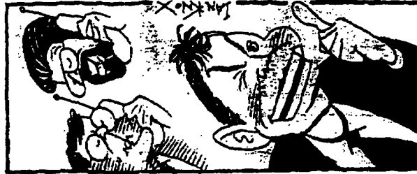
It's good to talk/decommission/talk

UK: 12, 17, 27, 28, 38, 40. Bonus 6. Jackpot: 55m. Three winners. Ireland: 9, 19, 23, 25, 28, 42. Bonus 11. Jackpot: $500,000. No winners.