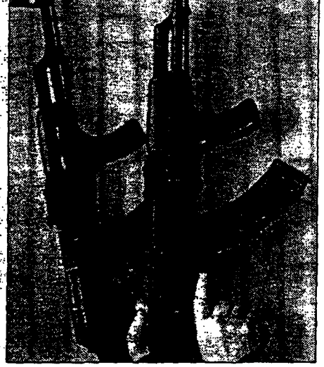
DEADLY... AK47 rifles identical to those recovered by police are put on show.