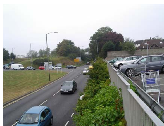
The A21 at Baldslow

Anticipated start date: 2010/11 Anticipated finish date: 2011/12