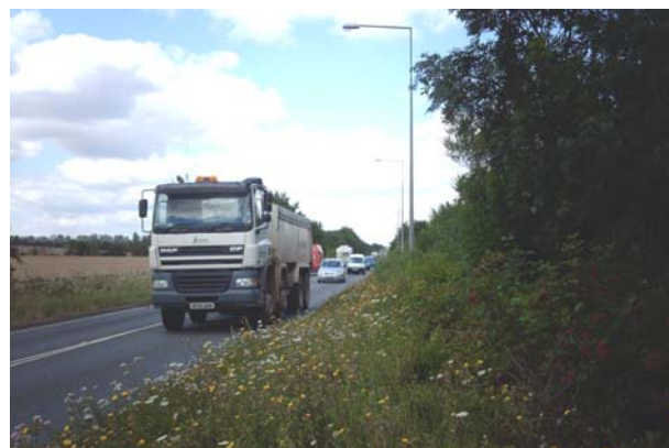
A421 Milton Keynes to M1

The A421 between Milton Keynes and Bedford is seen as a bottleneck in the wider road network to the west of Milton Keynes. Widening the route was recommended in the London to South Midlands Multi-Modal study (2003). The Milton Keynes South Midlands Sub-Regional Strategy (2004) identified a strategic need to improve the route, to reduce congestion, improve access and journey times. The area will benefit from better transport, which will also support new development.