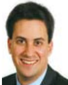
The Rt Hon Ed Miliband MP Minister for the Cabinet Office and Chancellor of the Duchy of Lancaster