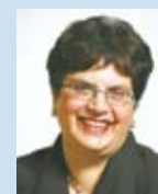
Baroness Prashar (Non-Executive Director)