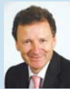
Gus O'Donnell Cabinet Secretary and Head of the Home Civil Service