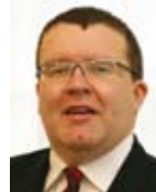
Tom Watson MP Parliamentary Secretary, Minister for Transformational Government