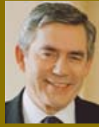
The Rt Hon Gordon Brown MP Prime Minister