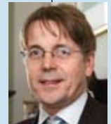
Jeremy Heywood Permanent Secretary, 10 Downing Street