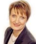
The Rt Hon Tessa Jowell MP Minister for the Olympics and London