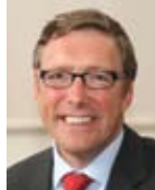
Phil Hope MP Parliamentary Secretary, Minister for the Third Sector and the East Midlands