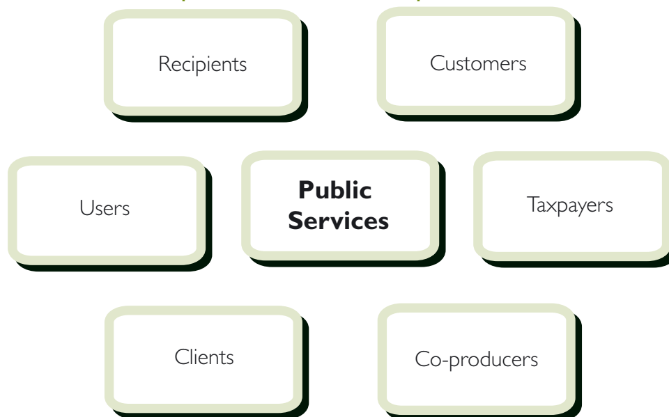
Figure 2.1: The relationship of services with the public