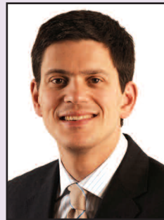
Rt Hon David Miliband MP

Minister of Communities and Local Government