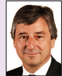
Jim Fitzpatrick MP