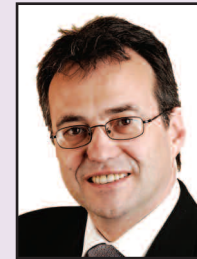
Phil Woolas MP

Minister of Communities and Local Government