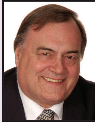
Rt Hon John Prescott MP

Deputy Prime Minister – First Secretary of State