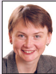
Yvette Cooper MP

Deputy Prime Minister – First Secretary of State