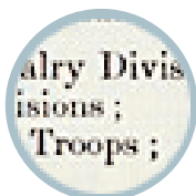
British Army preparations for war, 1911