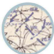
Map of the German Schlieffen Plan, 1905