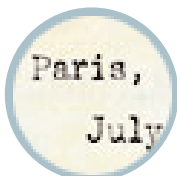
Letter on the French viewpoint, 1914