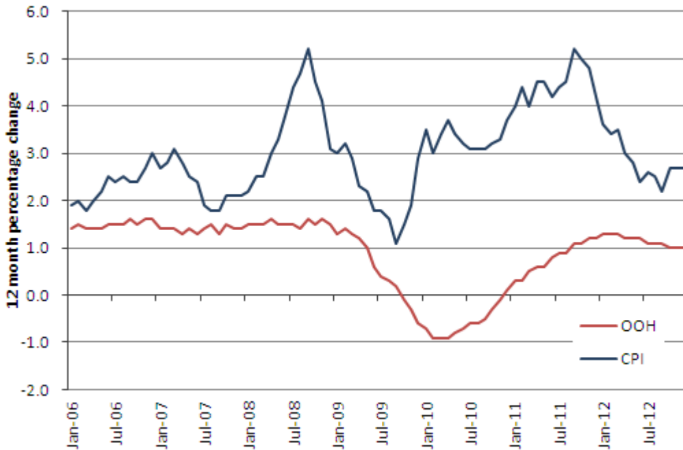
Figure 1: OOH 11 and CPI 12 month change 2006-2012

Figure 2 below compares CPIH and CPI from 2006 to 2012. Over the entire time period, CPIH is either lower than or equal to CPI. This is due to the OOH component which increased at a slower rate than CPI over this period. Between March 2010 and September 2011 the gap was widest reaching 0.5 percentage points on a regular basis. The average size of the gap from 2006 to 2012 is 0.2 percentage points.