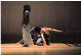
71 'Sense' from Blue Eyed Soul Dance Company production of Touch .