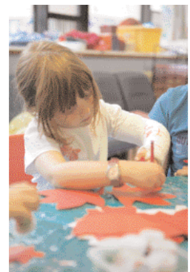
33 Workshop by Dance 4 at Queen's Medical Centre.