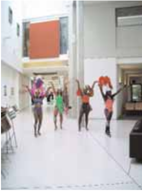
105 Artists in residence. Carnival dance troupe at ACAD Central Middlesex Hospital