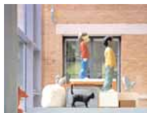
16 Kenny Hunter, Natural Selection , Great Ormond Street Hospital.