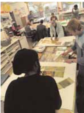
89 Bethlem Royal Hospital art studio, Occupational Therapy Department.