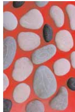
32 Engraved Pebbles, Fusion Project, West Cumberland Hospital.