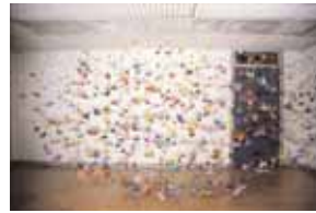
108 Suki Chan, Flight