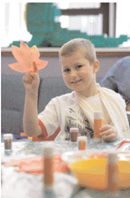
28 Workshop by Dance 4 at Queen's Medical Centre.