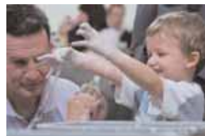
97 Birmingham Children's Hospital, Brittle Bones Group.