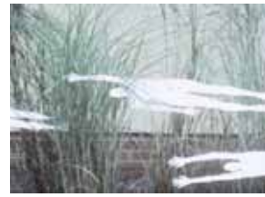
25 Kate Munro, Flight , stainless steel sculpture, Fromeside Clinic.