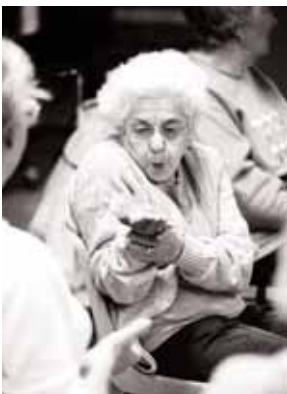
15 Gentle movement for elders.