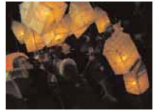
80 Harvest lantern procession, Bentham, North Yorkshire. Looking Well, Pioneer Projects.