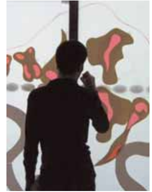
Section 5 Microcosmos, a Big Draw event organised by Elixir Arts at Queen Elizabeth Hospital, October 2005.