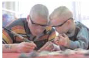
73 Father and son engraving images on to pebbles. Fusion Project, West Cumberland Hospital.