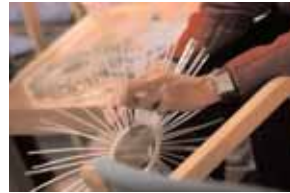
77 UHB Cancer Centre at Queen Elizabeth Hospital and Birmingham School of Jewellery.