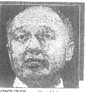
SPOILED ... Ken Livingstone

Ken Livingstone has insulted George Bush, the president of the USA, in this column. He has also insulted the president who has done more for his state than the London Mayor also refused to recognise him as the lawful US leader. Leaders are outraged at his attitude, especially after protesters have attacked in Tokyo.