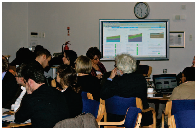
Group work during London workshop

Three Deliberative Dialogue workshops were conducted in England. Throughout the events, participants had a the opportunity to try out the Calculator on computers, engage in group discussions about the environmental themes that arise when using the Calculator, and then attempt to finalise a pathway on the Calculator that they would like to see implemented. The group discussions were moderated, and supported by stimulus material and an 'on-demand' expert, who could help with more detailed questions. This format was the same across the three workshops, but timings, number of computers, and number of experts on hand varied between locations. Full details of the discussion guides and stimulus materials are appended to this report.