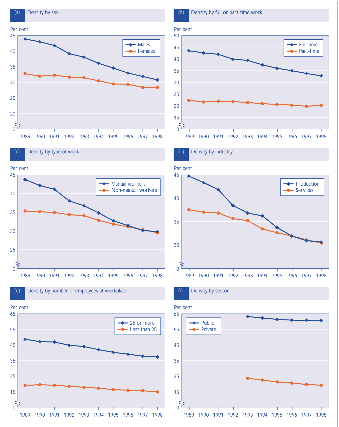
Figure 2 Union density; Great Britain; 1989-98