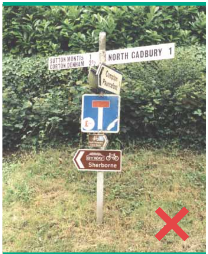
Modern signs and symbols must not be added to fingerposts