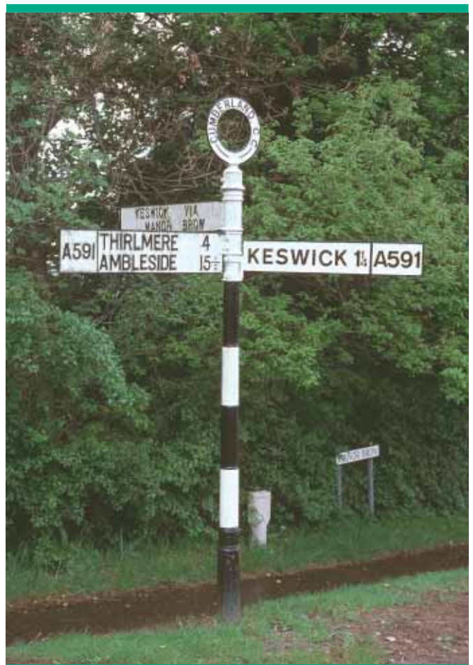
Traditional cast iron fingerposts reinforce local character: Cumbria