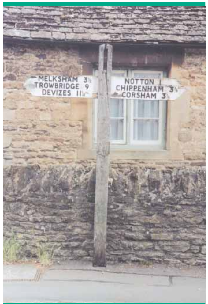
Routine repair and regular maintenance are essential