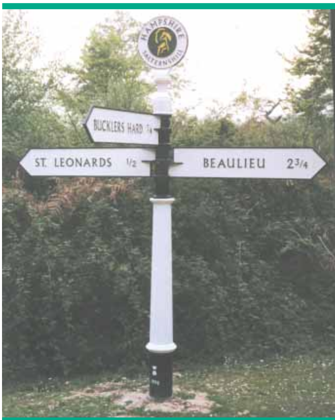
New cast iron fingerpost to traditional design: Salternshill, Hampshire

The original upper case fonts are no longer prescribed and therefore special authorisation is required. Alternatively, Transport Heavy alphabet, as shown on the Newton Longville example (diagram 2141 in the 2002 Regulations) may be used. Chapter 7 of the Traffic Signs Manual includes design guidance. Details of the fonts can be obtained from the Department for Transport. Where new fingerposts are installed, they should replace, not duplicate, existing signs.