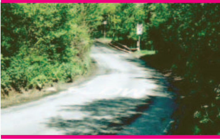
Lack of separate facility to the south of the scheme could put off vulnerable users

the narrower carriageway, they felt less safe travelling along Bird Lane than they had before scheme implementation. The fact that the non-motorised way is fairly narrow (about 1.5m) with a ditch alongside part of it may also have discouraged some cyclists and horse-riders from using this facility.