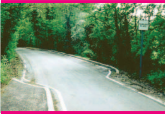
Some two-sided passing places were used to encourage giving way in both directions