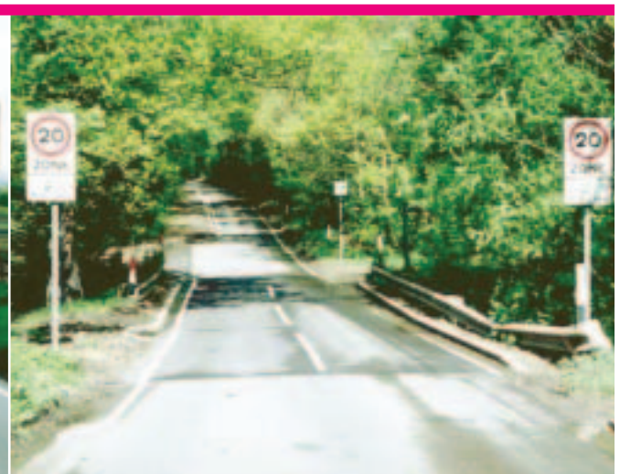
Northern entry to the scheme (left) had a greater speed reducing effect than the southern gateway