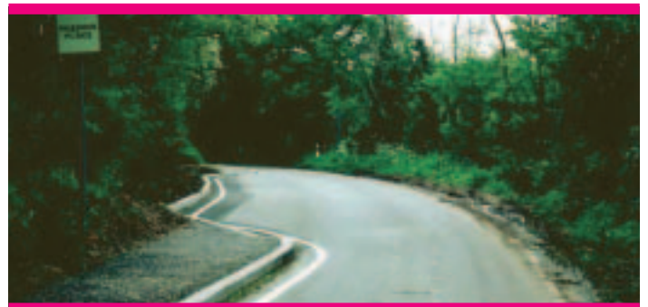
Verge erosion has continued opposite the passing places

The roadside verge along Bird Lane was considerably eroded before scheme implementation. Unfortunately, the nature of the scheme has led to continuing erosion opposite the passing places, probably because drivers move as far left as possible to wait for oncoming vehicles. Brentwood Borough Council has tried to overcome this problem by placing additional reflective posts at intervals along the lane. This has been only partially successful with vehicles continuing to encroach onto the verge between the posts. One possible alternative would be to use logs or kerbing alongside the carriageway as additional verge protection.