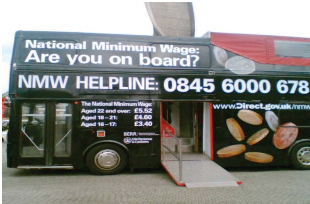
Figure 3: National Minimum Wage 'Outreach bus'