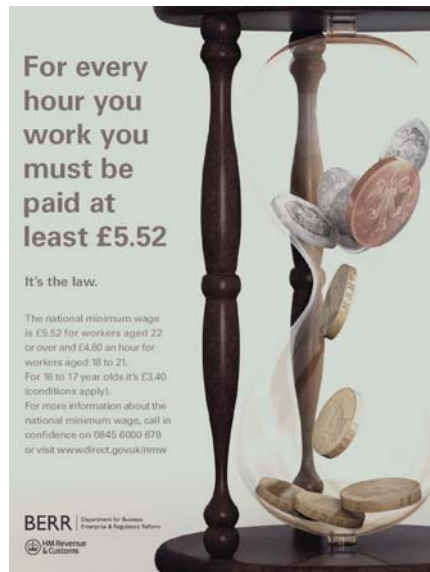
Figure 2: National Minimum Wage poster campaign