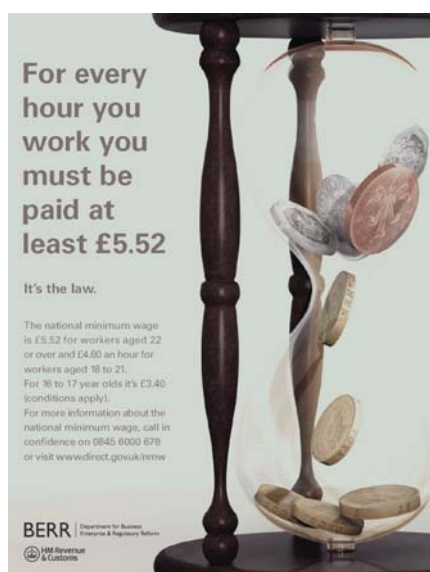
Figure 2: National Minimum Wage poster campaign