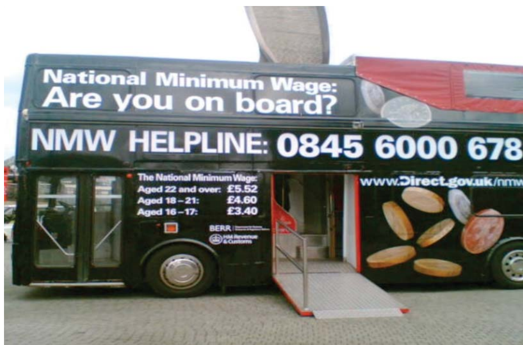
Figure 3: National Minimum Wage 'Outreach bus'