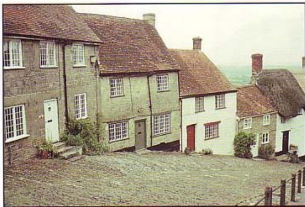
Existing setts complement character of the buildings.

Some modern street furniture uses historical styles. While there is certainly a role for reproductions, particularly where locally distinctive designs are used, there is also a place for modern designs to give continuity to a tradition of craftsmanship. An audit of existing traffic signs, with a view to rationalisation and maintenance, can be a useful way of improving the effectiveness of signs as well as removing clutter.