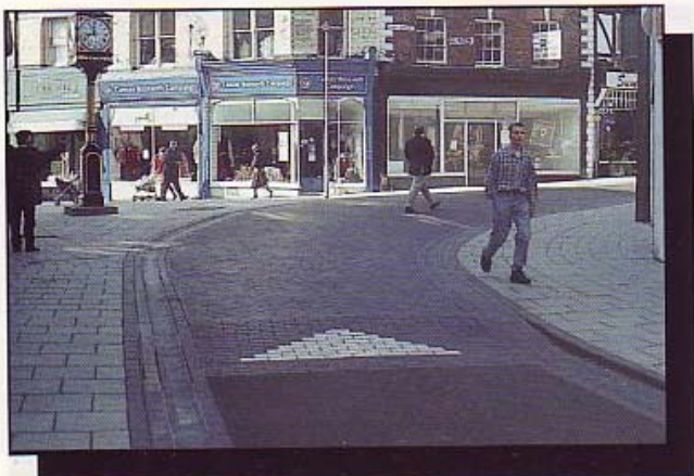
Coloured blocks used to indicate road markings.

However, in historic areas the traditional form and appearance of the street remains important. The traditional distinction between the carriageway and the footway may be important both visually and historically, and this may counsel against the adoption of a single wall-to-wall surfacing. An informed analysis of the existing situation will show whether traditional kerb lines and changes in level should be retained.