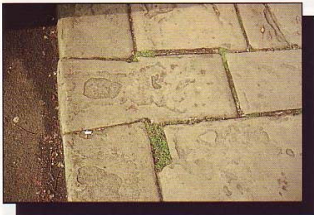
Pennant stone paving with dovetail jointing.

Bollards can be an obstacle, particularly for visually impaired people. To minimise the risks for pedestrians, where bollards are installed it is recommended that they are 1m high with a distinguishing colour at the top.