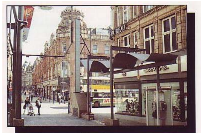
Modern street furniture in an historic setting.

Colour can also play a valuable role. Changing from orange low pressure sodium lighting to white high pressure sodium or tungsten can be a simple enhancement.