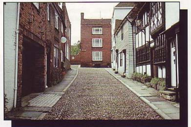
Maintaining the traditional relationship between footway and carriageway.

The Highways (Road Humps) Regulations are currently under review.