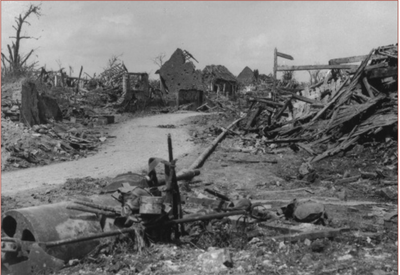
View in Mametz after its capture by the 7th Division on 1 July 1916.

The Battle of the Somme failed to achieve its original aim of breaking through the German lines. British and French troops managed to advance just seven miles over the course of four-and-a-half months of fighting.