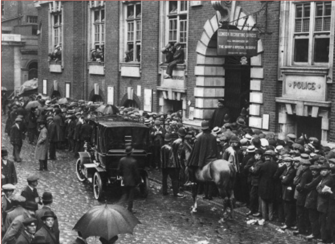
Recruits at Whitehall Recruiting Office, London, 1914.