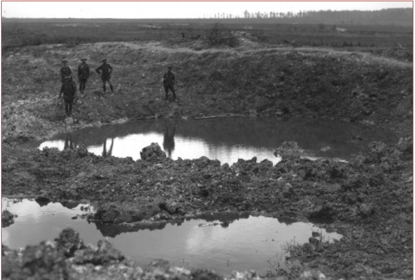
Water-logged mine crater near Mametz.