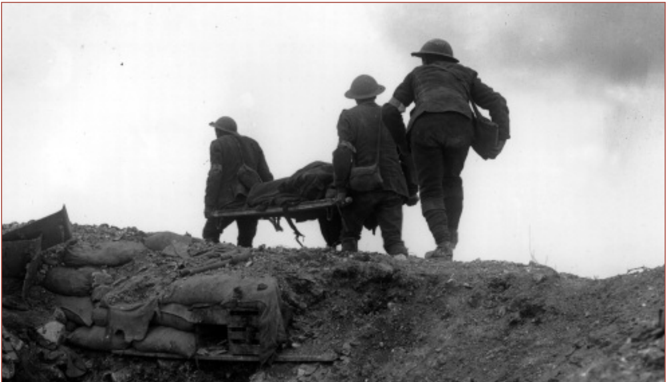
Stretcher-bearers carrying a wounded man over the top of a trench in the village of Thiepval.