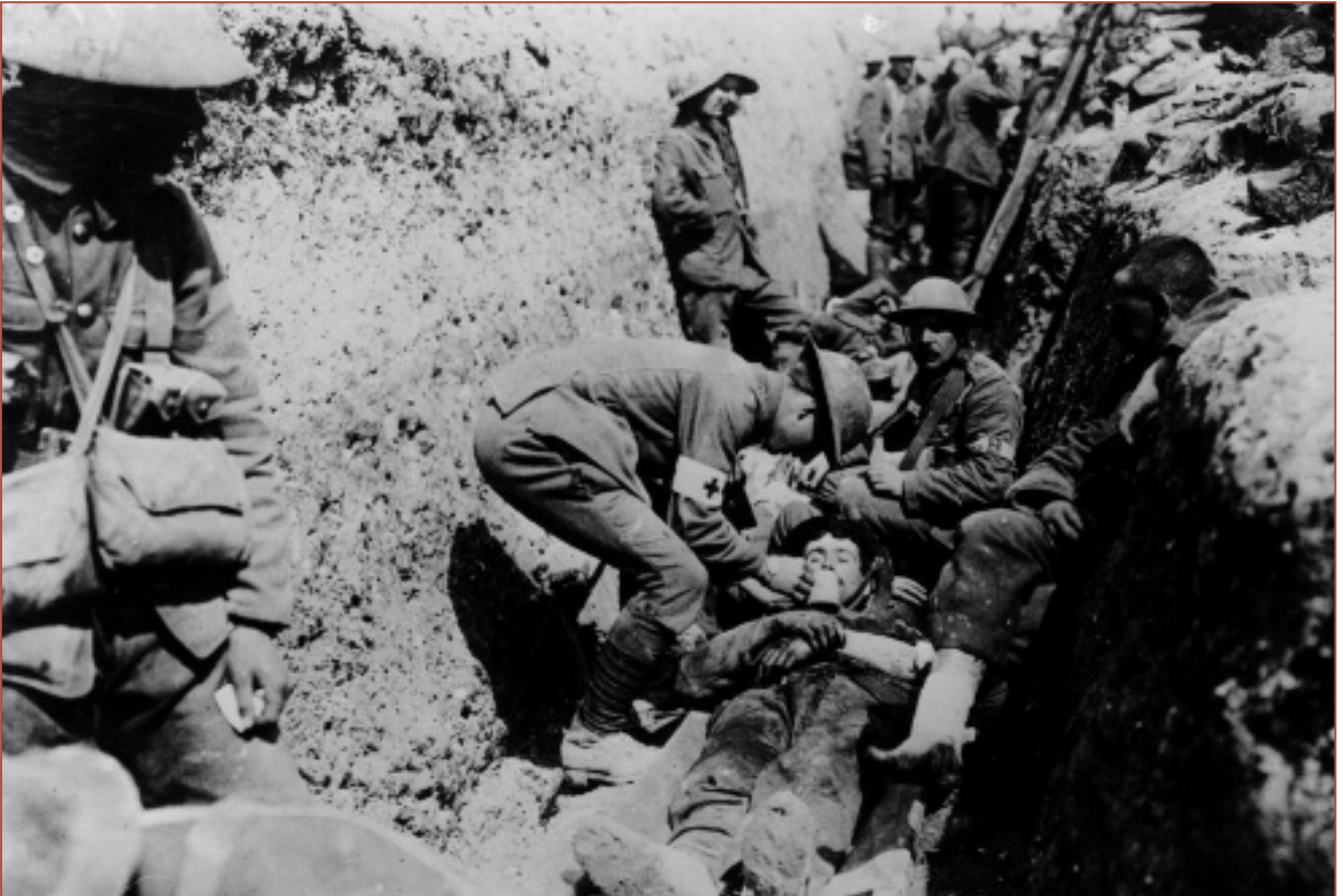
1st Lancashire Fusiliers tending their wounded in the trenches.