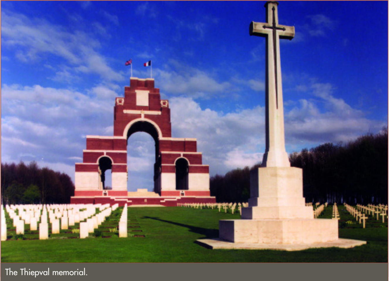
The Thiepval memorial.

Despite the passage of time, the landscape where the Battle of the Somme was fought still reveals the signs of the conflict – not least through the cemeteries and memorials in the area.