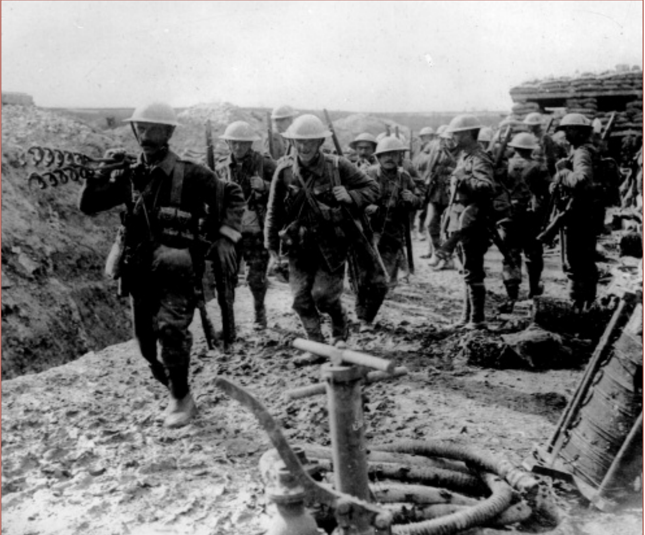
A wiring party from the Royal Warwickshire Regiment going up to the trenches.

The main aim of the Battle of the Somme was to break out of the stalemate that had settled along the length of the Western Front. But it was given added urgency by the need to relieve the pressure on the French troops who were involved in a desperate defence of a key fortified section of the front at Verdun, to the south.