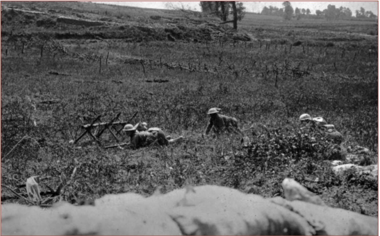
Patrol crawling up towards the German trenches during the attack on Beaumont-Hamel.

The Battle of the Somme began at 7.30am on 1 July 1916.