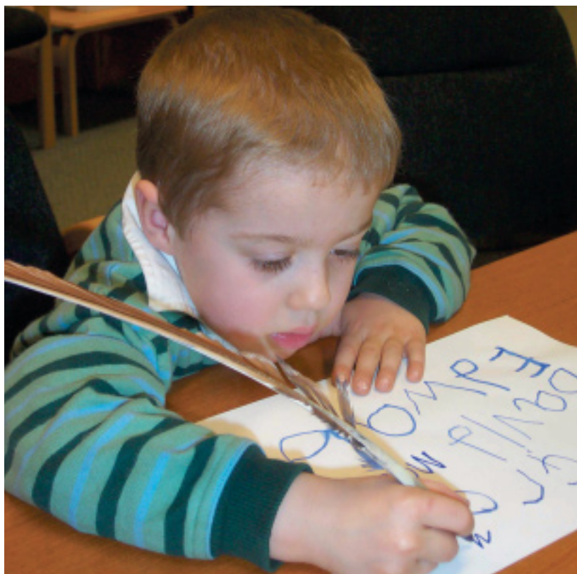
A visitor to the Charles Dickens event at the Family Records Centre

The first in a series of case studies went online in January 2003. It featured documents held by the consortium partners about the life of Isaac Rosenberg, the First World War poet.