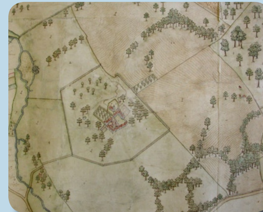
▲ Extract from detailed survey of the manor of Cashio, 1332. Eagle-eyed readers may be able to spot the reference to a 'cornershopp' at the bottom of the extract!