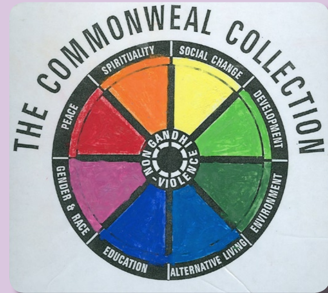
▲ Design for Commonweal Collection, 1970s, being catalogued as part of the PaxCat project, funded by the grants scheme in 2008 (copyright Commonweal Collection)

▶ nationalarchives.gov.uk/archives/cataloguing_grants_scheme.htm