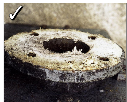
Gaskets or rope seals

If you have any doubts, carry out a risk assessment (see 'More help') or ask the client to employ an HSE-licensed asbestos contractor.