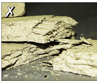
Damaged asbestos insulating board