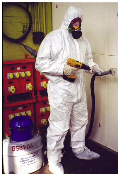
Using a Class H vacuum cleaner and a drill cowl