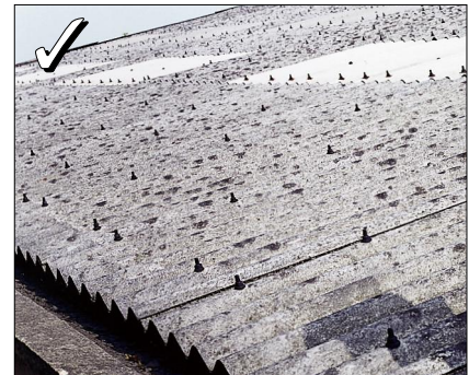
Asbestos cement sheets or guttering