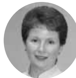
Hazel Blears, Police Minister:

“DNA evidence has transformed the fight against crime. Our national database is proving an invaluable intelligence tool and has already helped detect thousands of repeat criminals. It allows police to speed up detections, make earlier arrests, results in more convictions and helps to solve old crimes. This Government is committed to increasing the use of DNA evidence. We have invested £182 million in expanding the database and provisions in the Criminal Justice Bill will allow officers to take DNA samples at the point of arrest, rather than at the point of charge.