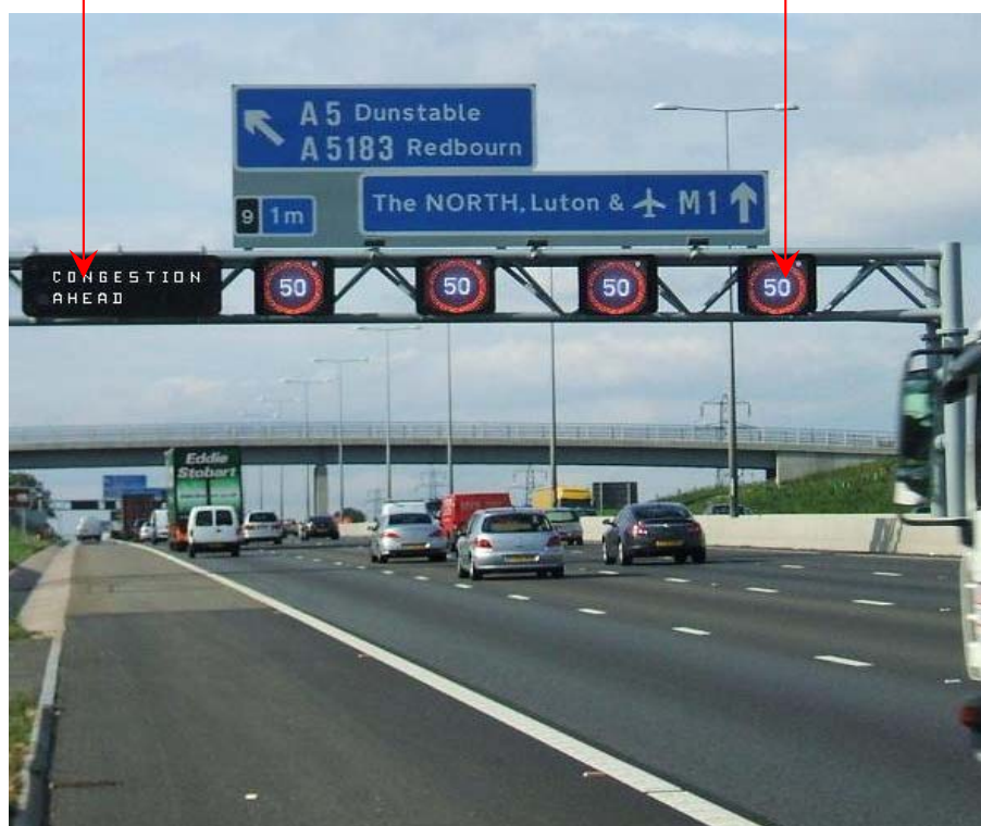
Figure 3B: Variable Mandatory Speed Limits

Variable mandatory speed limits will operate in a similar manner to the M25 junctions 10 to 16 controlled motorway scheme, which has variable mandatory speed limits displayed above all the main carriageway lanes. The variable mandatory speed limit signal will be displayed on gantries on the M1 between junctions 6A and 10. The speed selected will take account of prevailing traffic conditions and will be automatically calculated from sensors buried in the road surface.