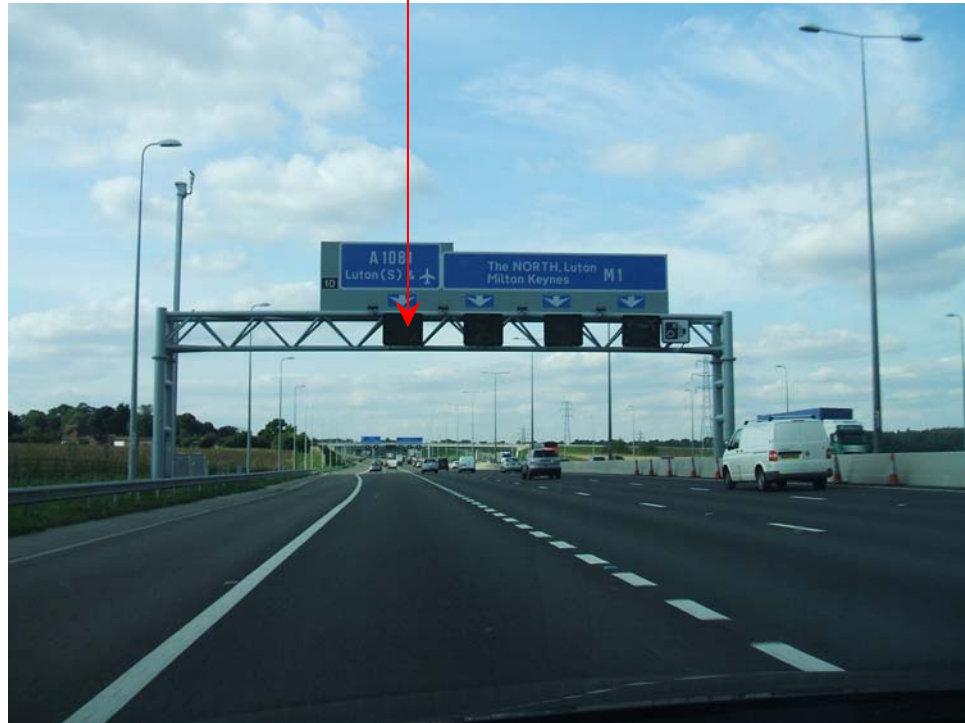
Figure 3A: The scheme during Normal Motorway Operations