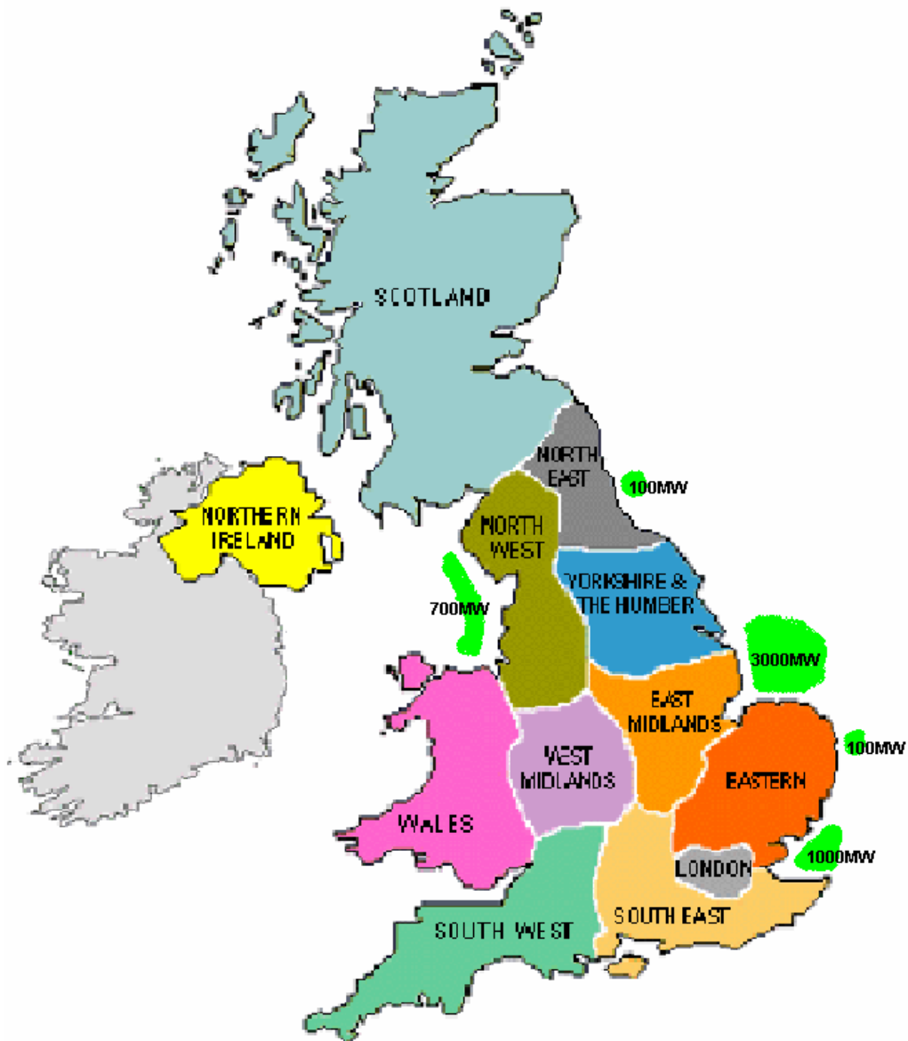
Figure 1: Assumed Pattern of Offshore Wind Generation

results for each study were then proportionately combined to produce an annualised constraint volume with a wind farm output that had the correct average load factor.