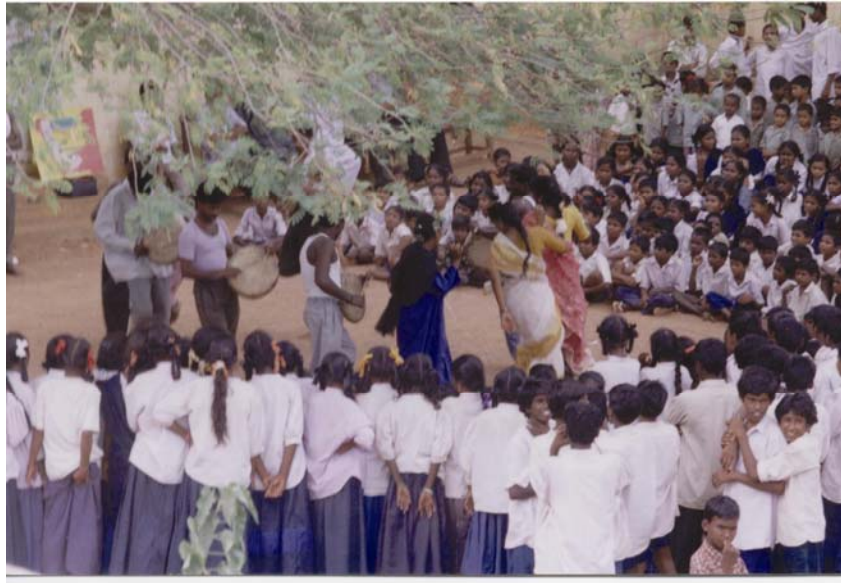
Awareness programme for schoolchildren in Tamil Nadu

An evaluation of the programme is taking place in April 2005. The current memorandum of agreement with ADD India expires in early 2007, so we anticipate presenting trustees with the findings of this evaluation in November, as a basis for discussion about our future relationship.