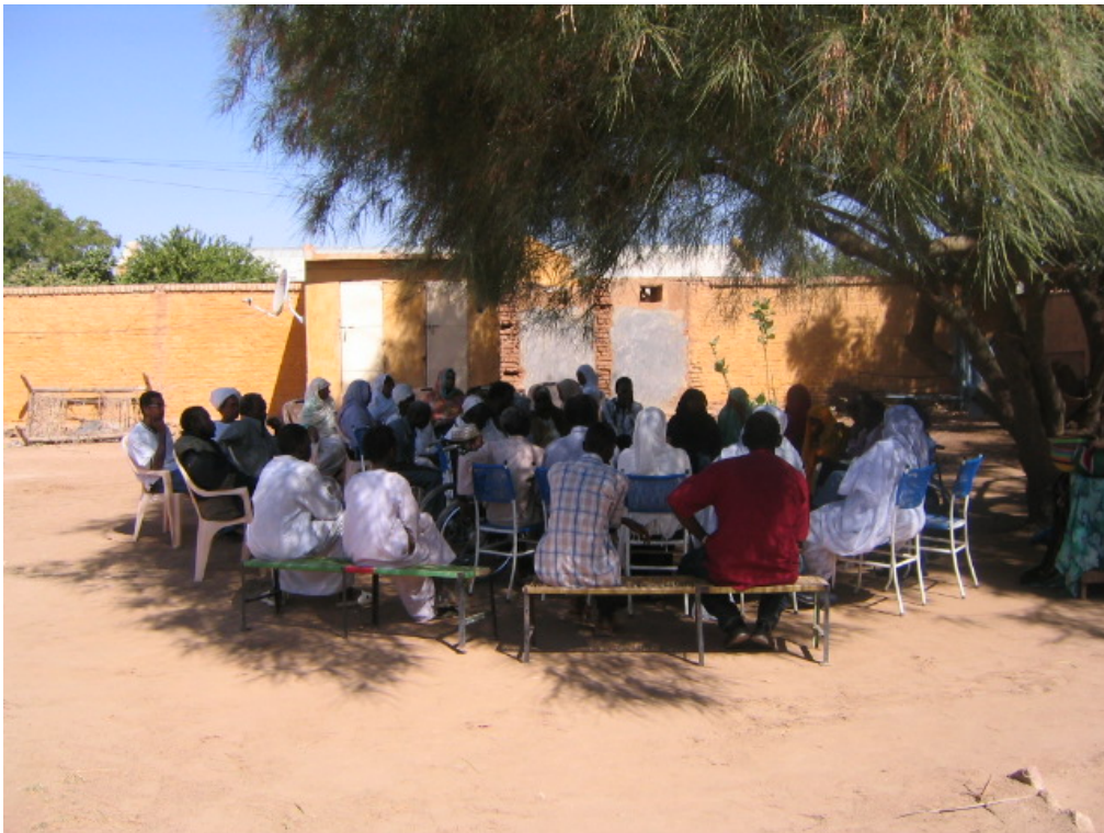
Kassala DPOs meeting at the Union of the Blind premises