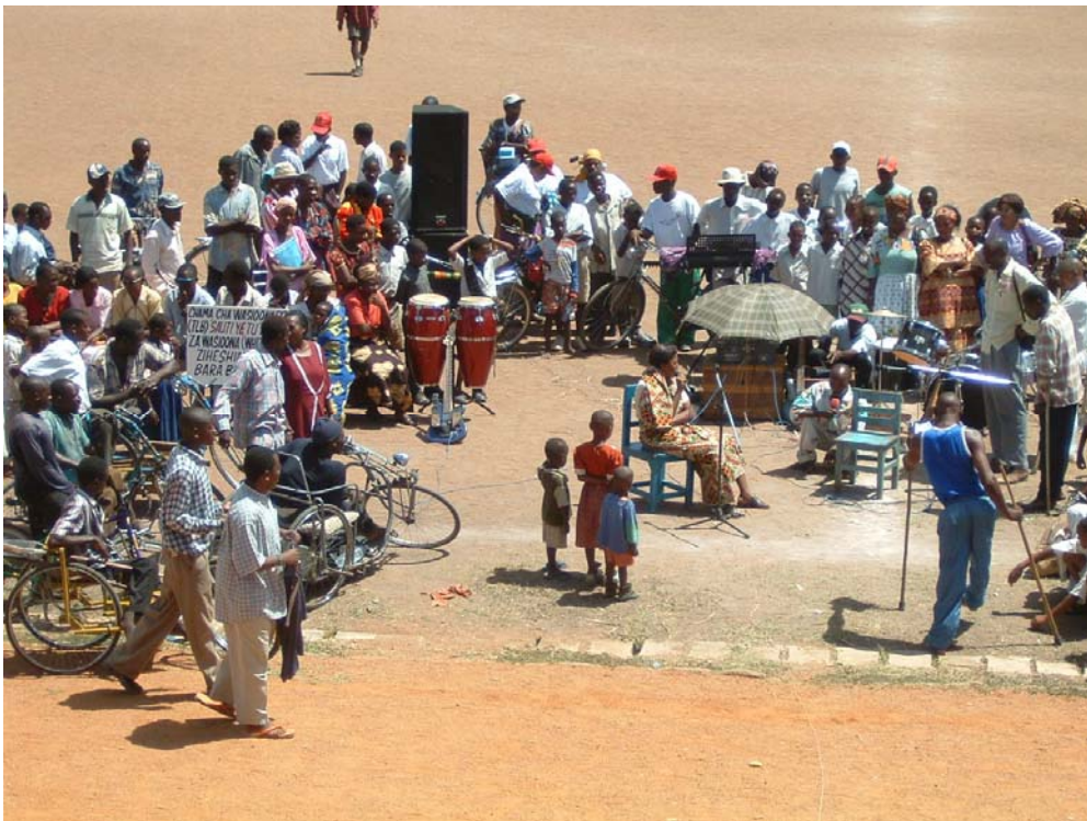
The Shinyanga football stadium, during the 3rd December celebrations. One of the groups put on a drama about the exclusion that disabled people face.

In 2004 the budget was £178,600, a decrease of 6% compared to 2003. Total expenditure was 6% over budget in Tsh, which was balanced in sterling by exchange rate gains. Contributory factors to the overspend included evaluation expenses, the special audit for SHIVYAWATA national and regional, and staff terminal benefits.