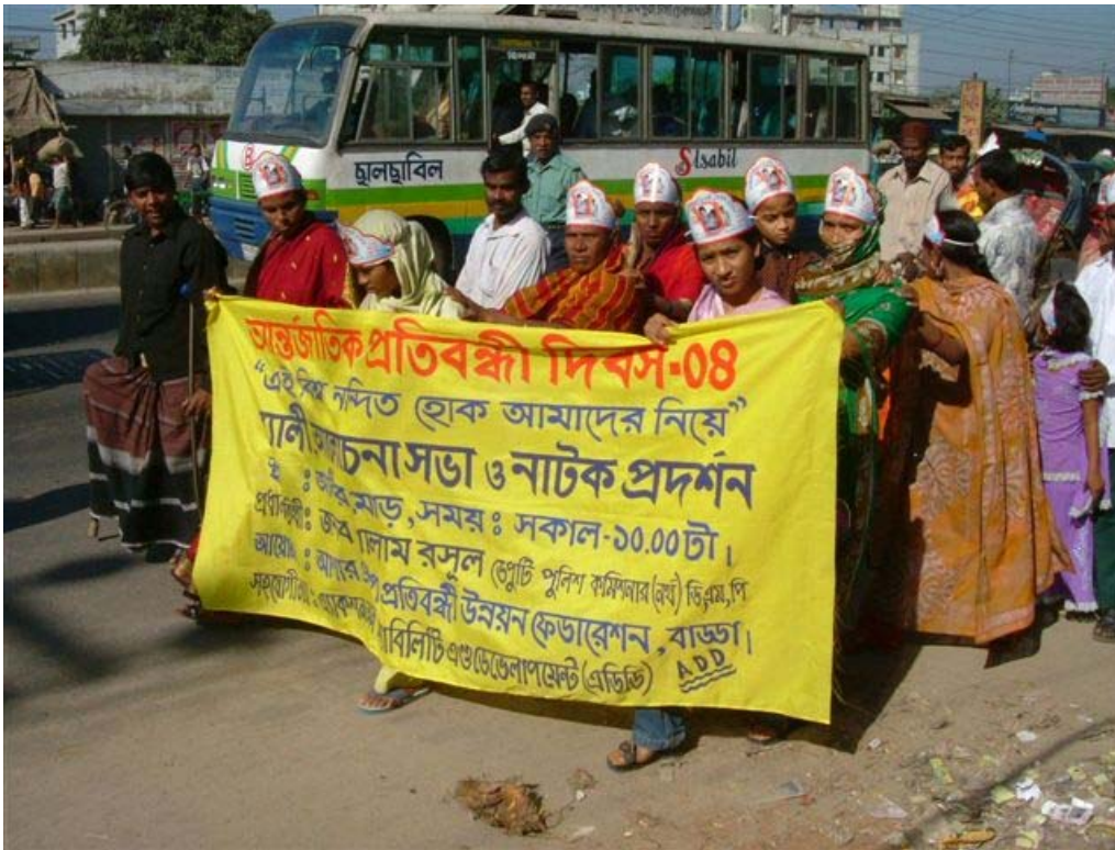
Badda march with banner in Bangladesh