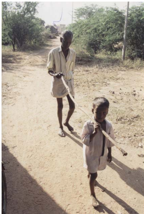
Guidance – A small boy guiding a visual impaired person in his village