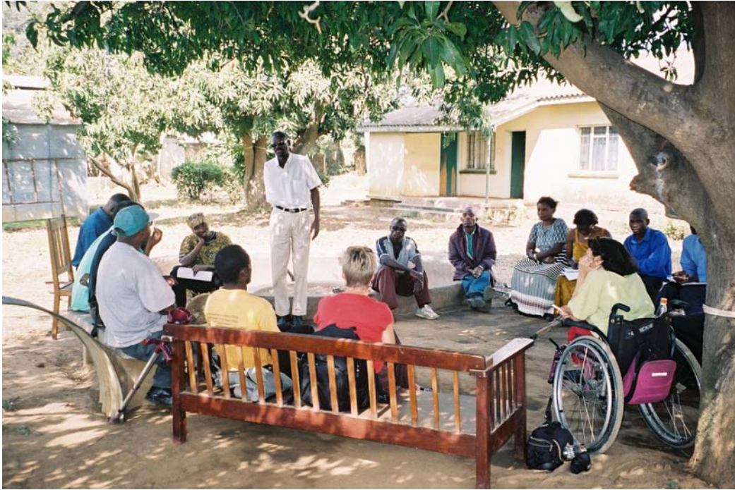
DPO meeting in Mazabuka