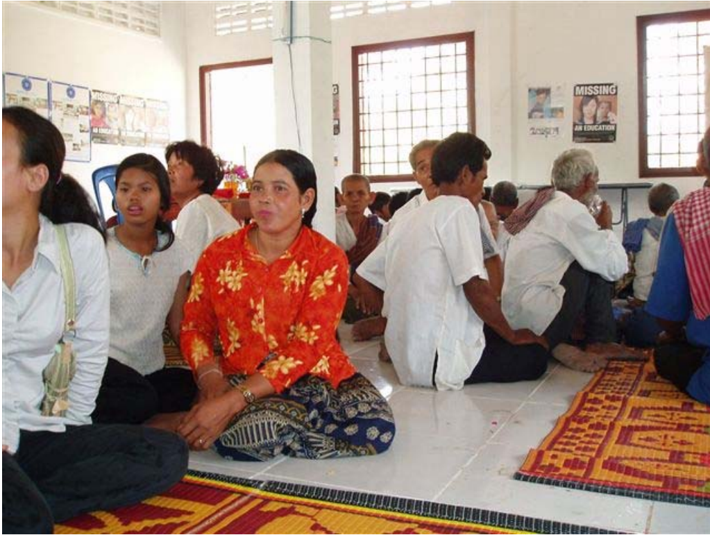
Peany Disabled People's Development Federation, Kampong Tralach