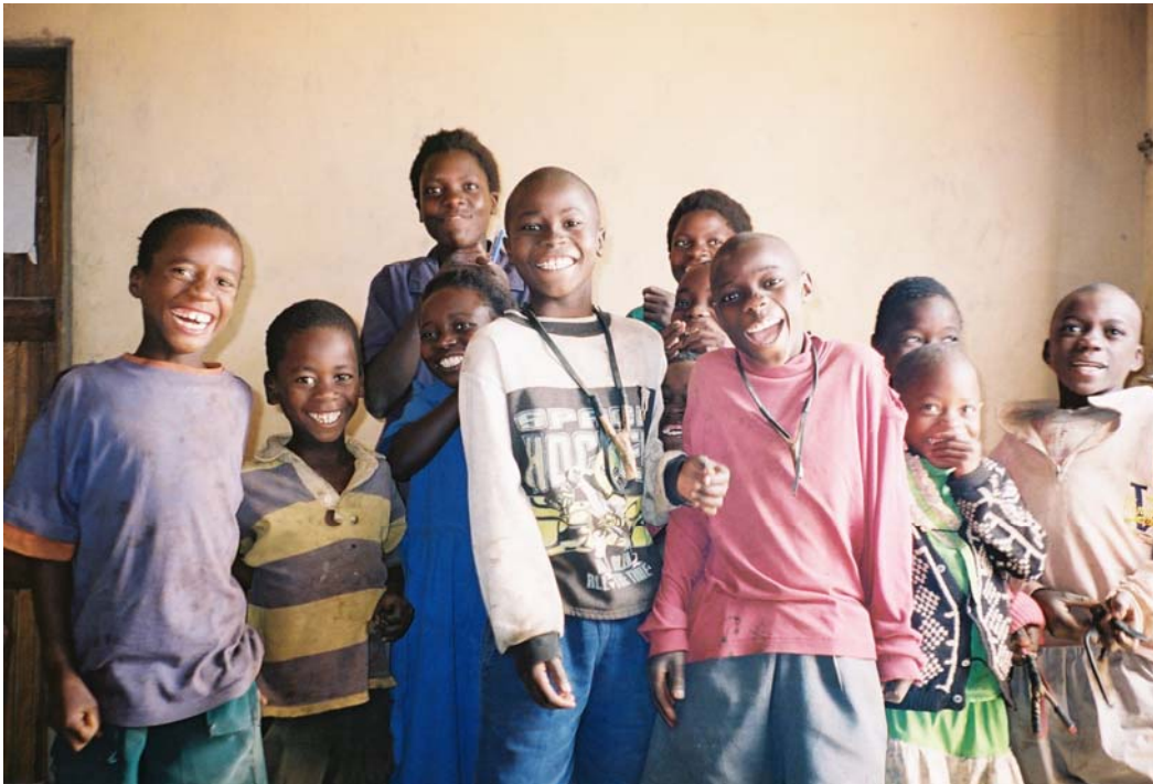
Children from the Nameembo Branch of ZNAPH