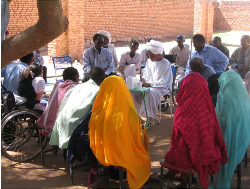
Primary Health Clinic at the Union of the Blind in Kassala