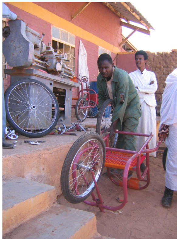
Mobility Workshop in Kassala