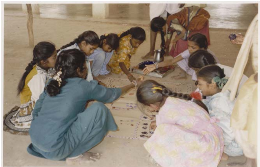
Child to child programme being held at Karnataka