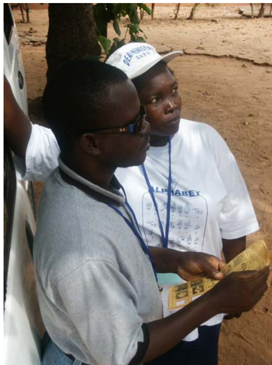
Members of the Liberia disability movement delegation learn about the tactile ballot guide in the Ghana elections