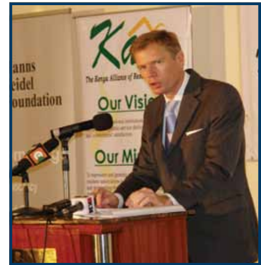
British High Commissioner to Kenya, Rob Macaire, addressing a civil society meeting

Regrettably, corruption remains endemic in Kenya. Altering the incentive framework will take time. But these measures will help promote Kenyan capacity, and pressure, to address corruption.