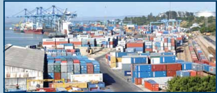
Congestion at Mombasa port

The World Bank Assessment of the Investment Climate in Kenya 2009 notes that corruption cost Kenya up to 4% of annual sales value, and up to 12% where it involved public procurement. This is a high amount by international standards and added to other indirect costs, like those associated with insecurity, negatively affects investor confidence and economic growth.