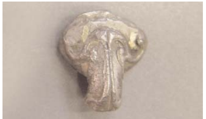
(Fig. 433.1) Church Minshull, Cheshire