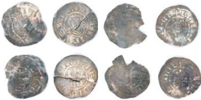
(Fig. 459) Carleton Rode, Norfolk