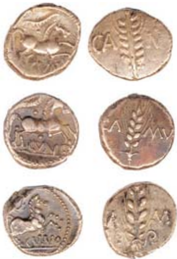
(Fig. 422.1, 422.2 & 422.3) Clacton area, Essex