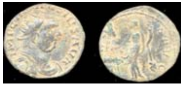
(Fig. 445.1) Gilmorton, Leicestershire