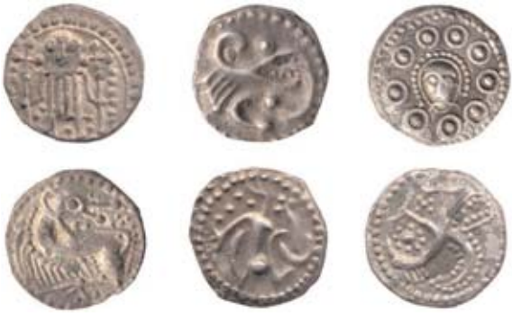
(Fig. 456) Itchen Valley, Hampshire (Enlarged)