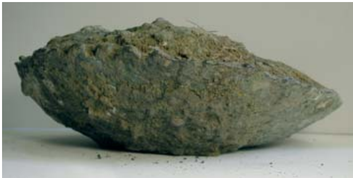
(Fig. 421.3) South Wight, Isle of Wight (Approx. quarter life-size)