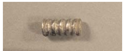
(Fig. 455) Hoxne, Suffolk