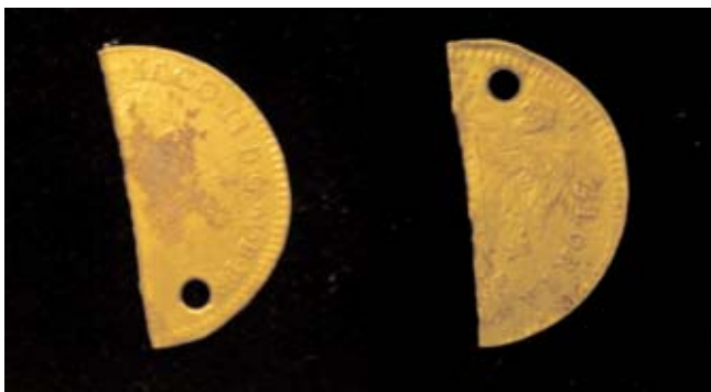
(Fig. 480) Bankside, Greater London (Twice life-size)