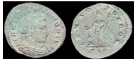
(Fig. 446.4) Bury St Edmunds area, Suffolk: Maximinus II (Bastien 476)