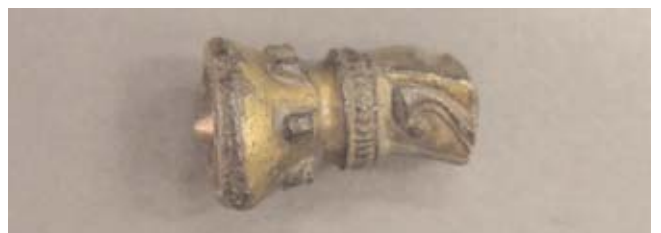
(Fig. 433.3) Church Minshull, Cheshire