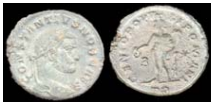
(Fig. 446.3) Bury St Edmunds area, Suffolk: Constantius I (Trier RIC 357a)