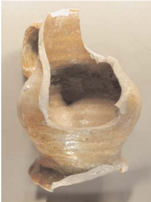
(Fig. 469.2) Okeford Fitzpaine, Dorset (Approx half life-size)