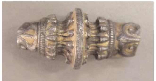
(Fig. 433.2) Church Minshull, Cheshire