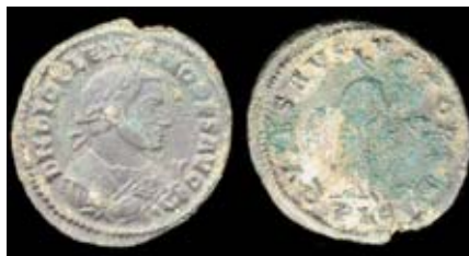
(Fig. 446.1) Bury St Edmunds area, Suffolk: Diocletian (Lyon RIC 276)