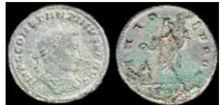
(Fig. 446.6) Bury St Edmunds area, Suffolk: Constantine I (Lyon RIC 255)