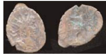
(Fig. 445.2) Gilmorton, Leicestershire