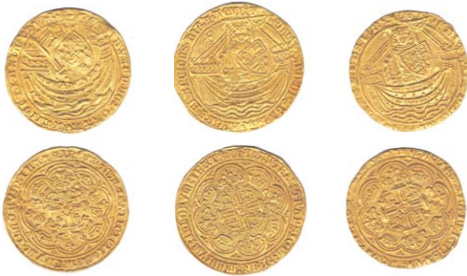
(Fig. 465.1 & 2) Ambridge area, Essex