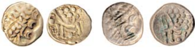
(Fig. 421.1 & 421.2) South Wight, Isle of Wight