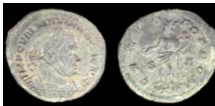
(Fig. 446.2) Bury St Edmunds area, Suffolk: Maximian (Trier RIC 768)