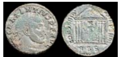
(Fig. 446.5) Bury St Edmunds area, Suffolk: Maxentius II (Rome RIC 210)