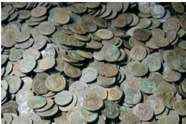
(Fig. 450) Thornbury, South Gloucestershire (Not to scale)