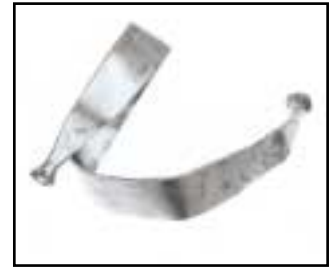
(Fig.4) West Wight