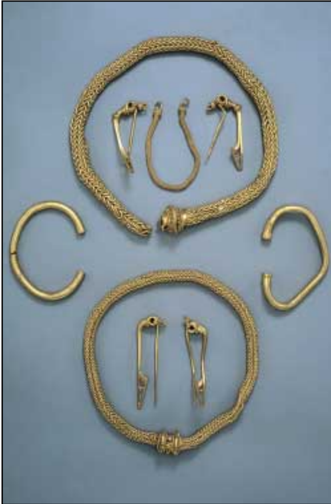
(Fig.8) Winchester area