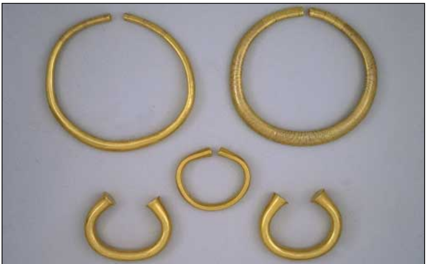
(Fig.5) Milton Keynes

Description: (1) Neckring 1: a penannular ring of thick gold bar of elliptical cross-section, the whole ring is decorated with incised radial lines except for a plain strip all along the rear face; there is more complex groove decoration near the terminals. (2) Neckring 2: a penannular ring of thick gold bar of elliptical cross-section, decorated near the terminal zones only, with bands of close-set grooves.