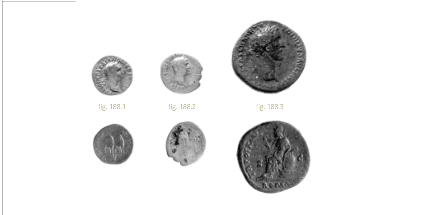
(fig. 188) Hickleton