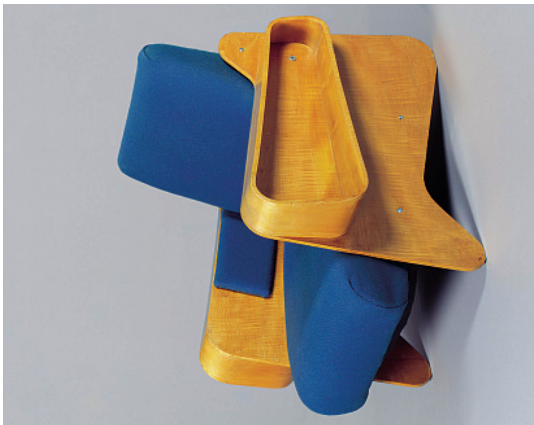
Plate XVII An armchair designed by Marcel Breuer in 1936