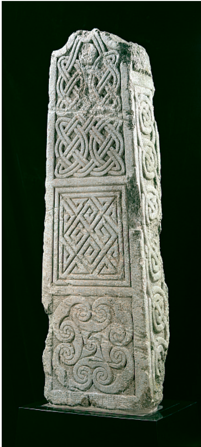
Plate III A stone cross-shaft