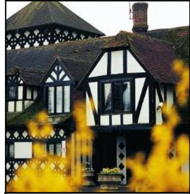
The Hever Hotel

There are a number of B&Bs in the local area which offer quaint rural retreats, such as the Hever Hotel, the Royal Oak Hotel, the Kings Arms and the Moorings Hotel as well as larger hotels such as the Best Western Donnington Manor and the two hotels at Brands Hatch (Brands Hatch Place and the Thistle). Accommodation of this nature is rather limited, however, and it is thought that, should a casino be sited in the district, private investment of this nature would help provide local jobs for local people.