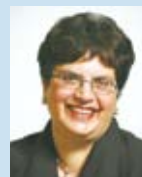
Baroness Prashar (Non-Executive Director)