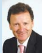
Gus O'Donnell Cabinet Secretary and Head of the Home Civil Service