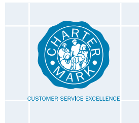
Colour with exclusion zone

The exclusion zone is the area surrounding the logo that must be kept free of graphics. The diagram opposite indicates the size of the exclusion zone, which depends on the size of the logo. The exclusion zone is a quarter of the width of the strapline as indicated opposite.