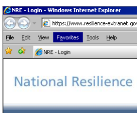
Loading the NRE from a bookmark or link